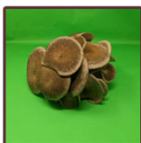
Black Pearl Oyster