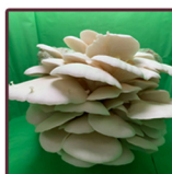
Super Scallop Oyster