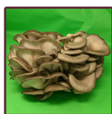
King Blue Oyster