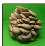
Grey Dove Oyster